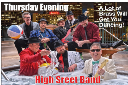
High Street Band