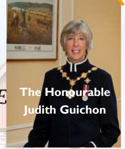
The Honourable Judith Guichon