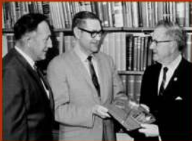
Sightlife was originally founded in 1969 by the Lions of the Pacific Northwest.

“Our Mission: We serve as a global leader and partner to eliminate corneal blindness worldwide by 2040.”