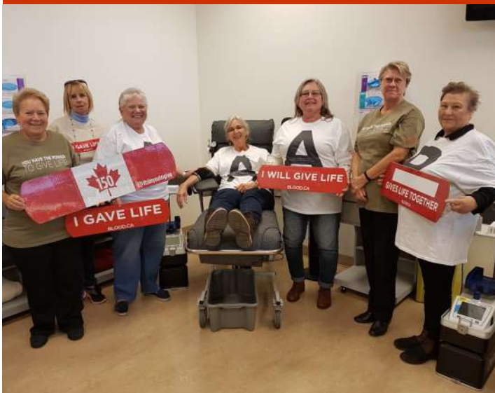
Sooke Harbourside Lions at the Blood Services in Saanich Sooke Harbourside Lions challenge MD19 Clubs to donate

This number will be on line so that any Lion in Canada (except Quebec) can schedule a time to give blood. Information will remain confidential.